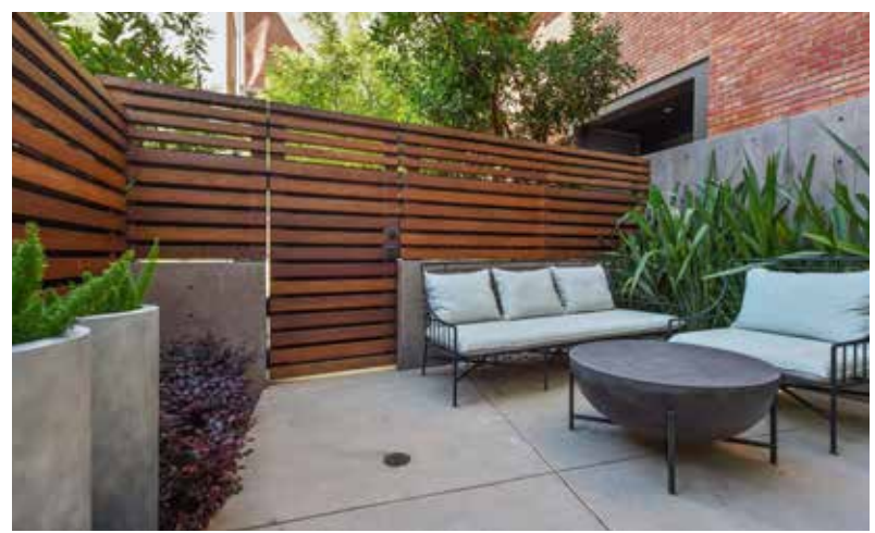
Offered for: $3,998,000

3 bedrooms, 3.5 baths gourmet gas kitchen 1 independent parking space Landscaped patio Custom closets, laundry room 2016 construction, air-conditioning Walkscore – 97